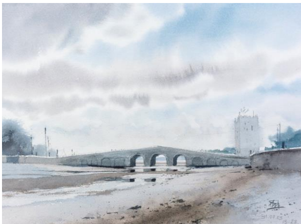
Belvelly Bridge and Castle (Plein air), Watercolour on paper, 31x23 cm, Summer 2023 €380 Framed