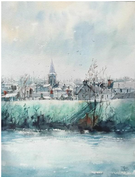
Blackwater River in Fermoy, Watercolour on paper, 41x30 cm Winter 2023 €320 Framed