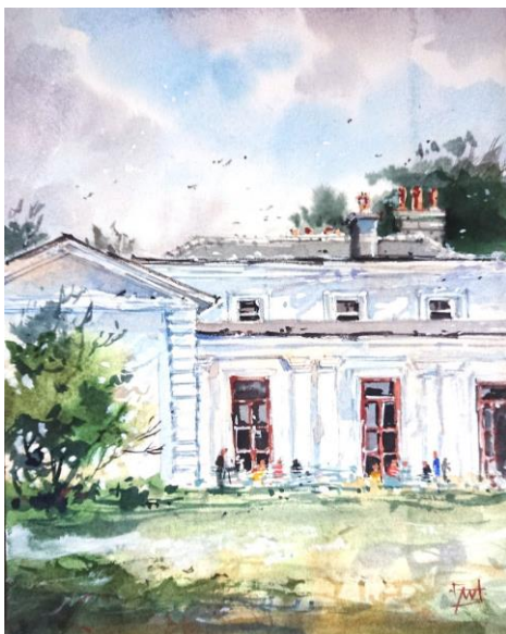
Coffee time at Fota House, (Plein air), Watercolour on paper 31x23 cm approximately, Spring 2023 €290 Framed