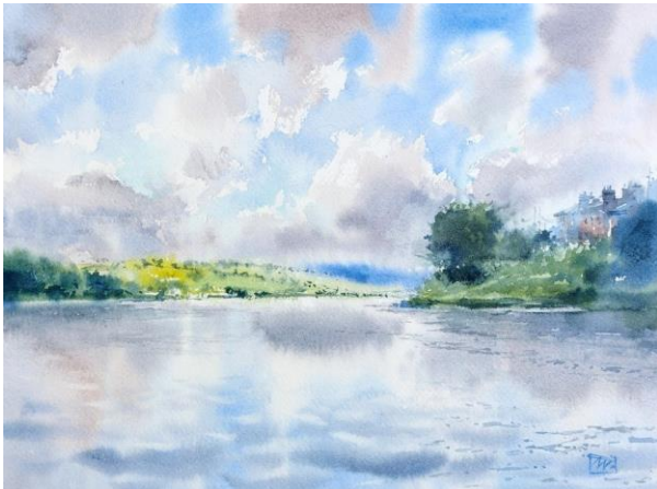
Lee at High Tide, Blackrock Pier, Cork (Plein air), Watercolour on paper, 31x23 cm, Summer 2023 €320 Framed