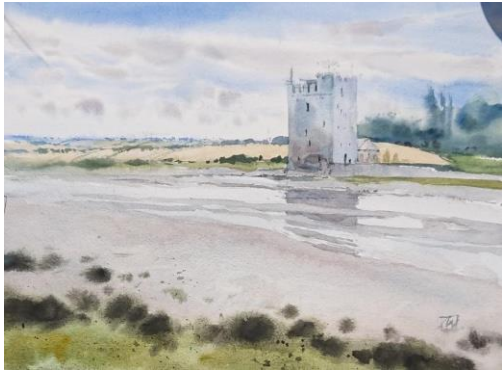
Low tide in a sunny day, Belvelly castle (Plein air), Watercolour on paper, 31x23 cm, Summer 2023 €370 Framed