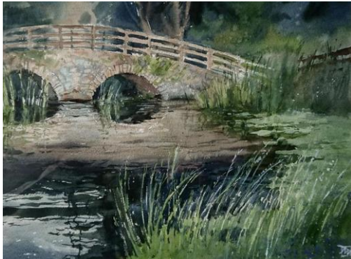
Old bridge in Doneraile Park (Plein air during Doneraile Art Festival 2022) Watercolour on paper, 41x30cm €400 Framed