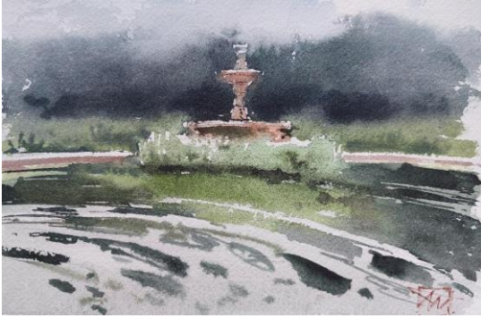
A calm evening at Fitzgerald Park, Cork (Plein air) Watercolour on paper 23x14.5cm, Summer 2023 €290 Framed