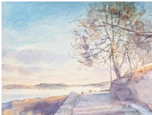
Rossleague walk, Great Island, Cork, Watercolour on paper, 28x21 cm, 2021 €350 Framed