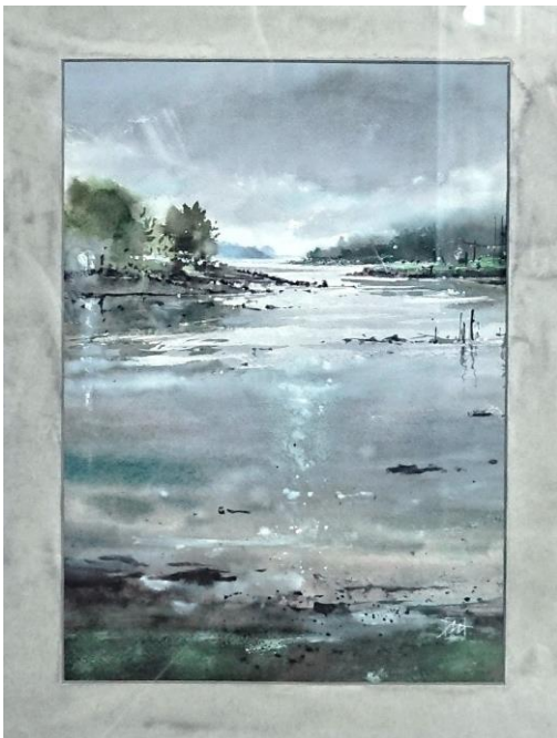
Low tide in Oysterhaven, Watercolour on paper 31x23 cm, Summer 2023 €320 Framed