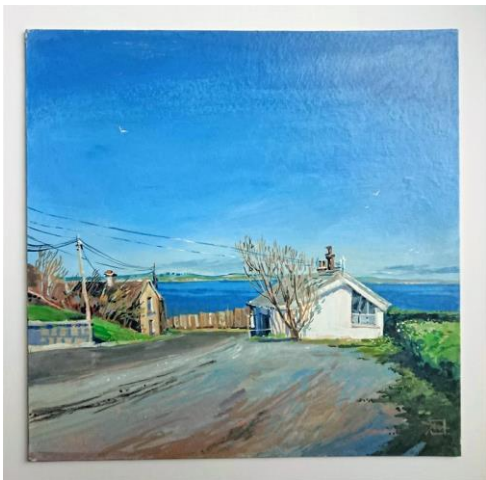
White house near Myrtleville, Gouache on cardboard, varnished 20x20cm, Spring 2022 €290 Framed