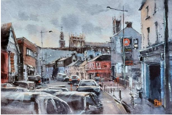
Watercourse Rd., the view to St. Mary Cathedral and Shandon, Blackpool, Cork, Watercolour on paper, 31x23 cm, Winter 2023 €370 Framed